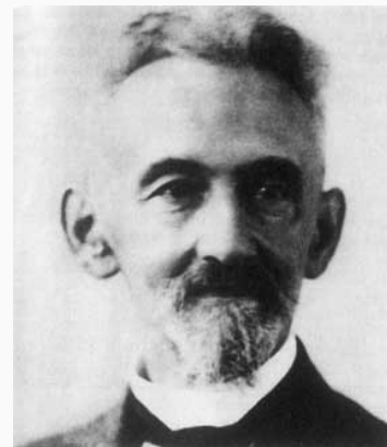
Toeplitz, Hausdorff [P1]